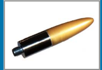
HGL "Golden Lipstick" Hydrophone