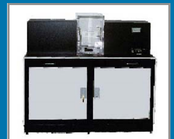
OptiSon Imaging System