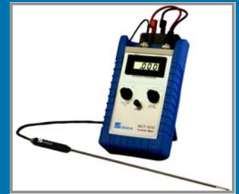
HCT Cleaning Tank Hydrophone