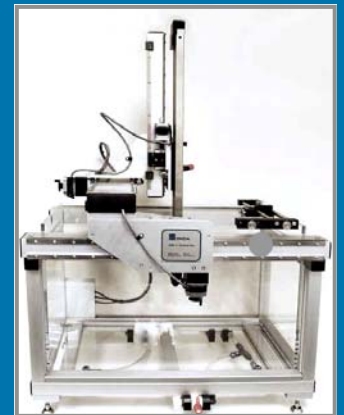
AIMS III Scanning System